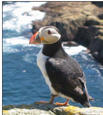
Puffin