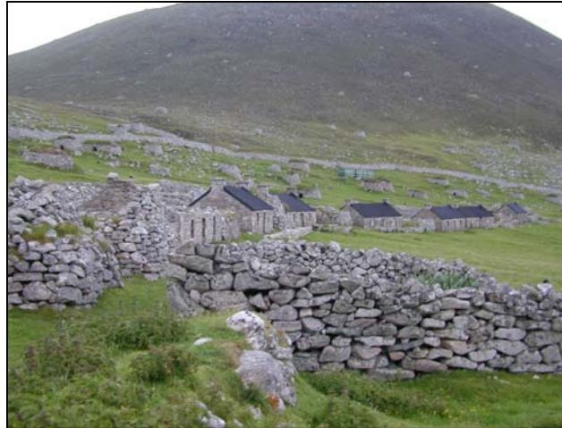
The village on Hirta

St. Kilda is home to the St. Kilda Wren and the St. Kilda Fieldmouse. If you look closely at the many stone walls running through the village and on the island, you will see them flitting about. It is also home to the Soay sheep. It is an ancient breed which dates back to the Bronze Age. They certainly don't look like a modern sheep.